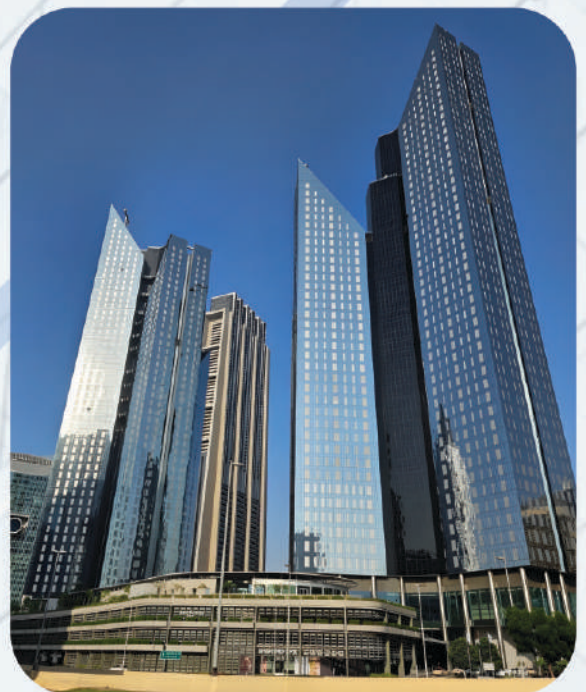
Central Park Residential Tower