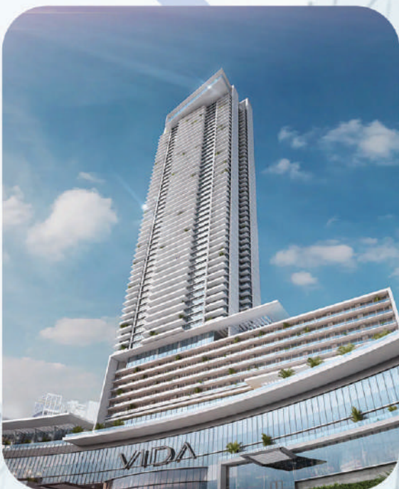
Vida Hotel Project