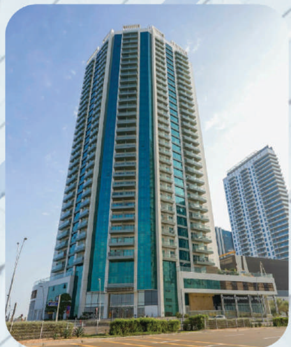
Sea Side Tower