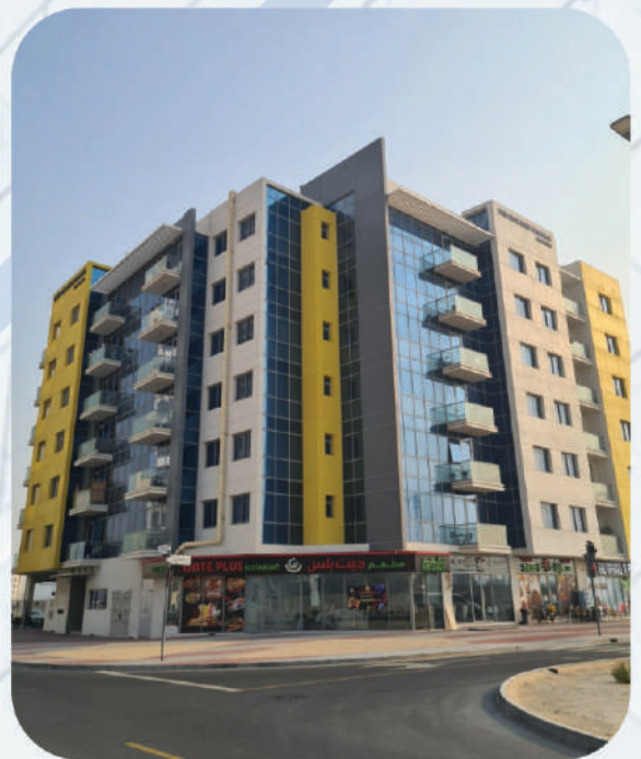
The Blue Reef Al Barsha