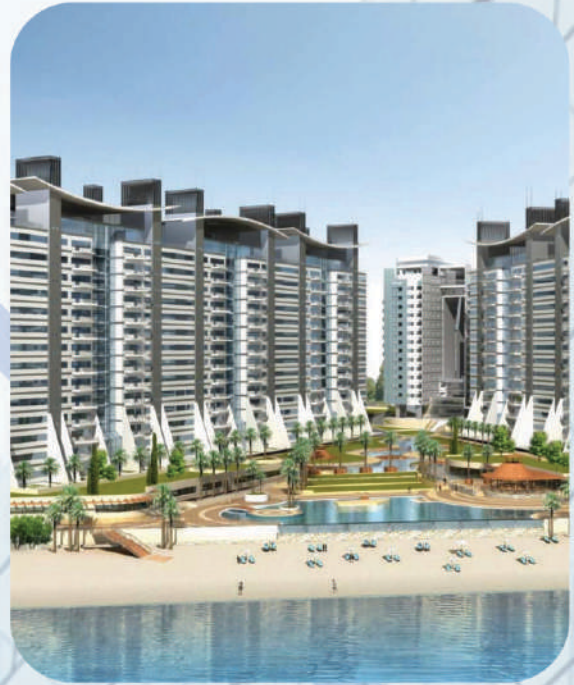
The Palm Jumeirah- Oceana Project